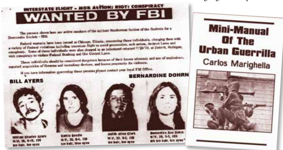
Terrorist how-to manual: For more than 40 years, terrorists from the Weatherman group (shown) to al-Qaeda have looked to the Mini-Manual of the Urban Guerrilla for tactical guidance.