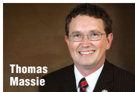
Congressman Thomas Massie Exposing the Swamp

Red Lion Paper Valley Hotel, 333 W. College Ave. • Appleton, WI 54911 • 920-733-8000