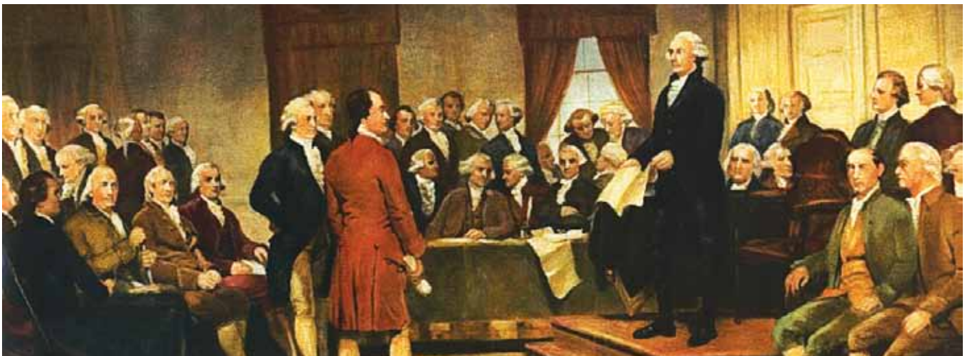
Delegates from 12 of the 13 states met in Philadelphia in 1787 to consider suggested amendments to the Articles of Confederation. At the end of that historic summer, an entirely new constitution establishing a new government was drafted and presented to the states for ratification.

To assert, then, that the Constitutional Convention was not “runaway” with regard