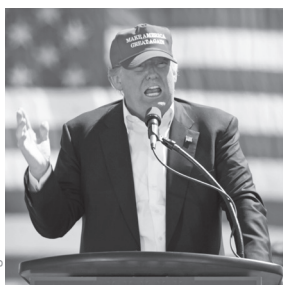
"NAFTA is a disaster!"